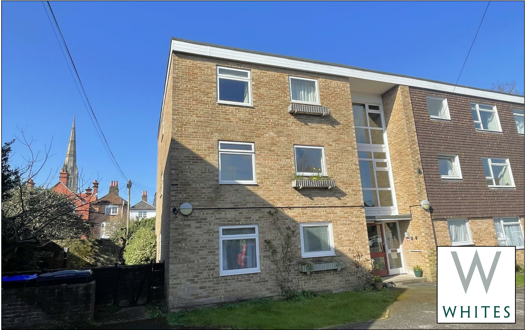
Flat 3 St Anns Court, Friary Lane, Salisbury, Wiltshire, SP1 2HB